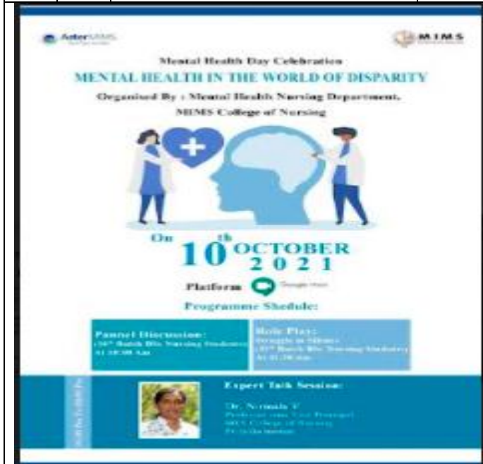
Fig.1 Webinar conducted on World Mental Health Day