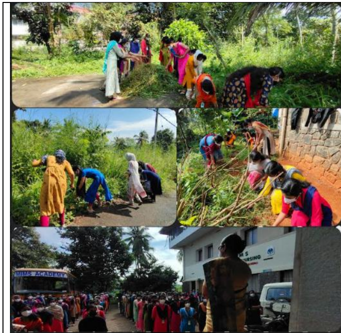
Fig. 1 NSS Volunteers and faculty participating in Mass cleaning drive conducted at college campus and its premises