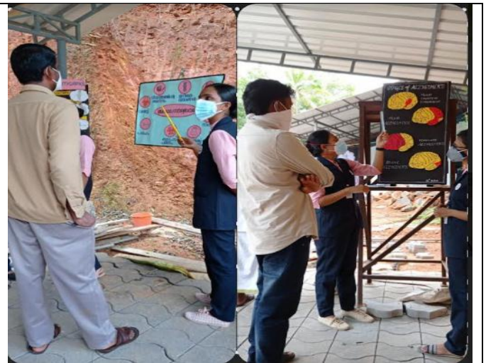
Fig. 1 The webinar held on Alzheimer's day